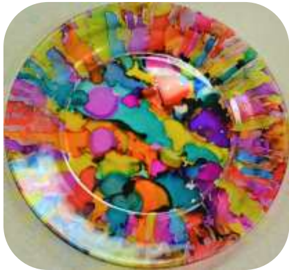
Alcohol Ink Plates